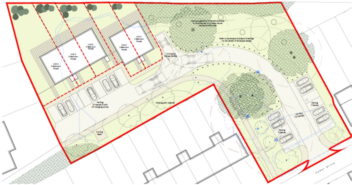
Community shop & new parking